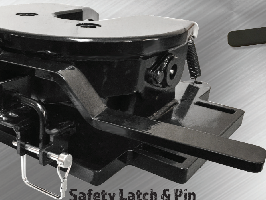
Safety Latch & Pin To Ensure Locking

We took Power & Strength to a whole new level