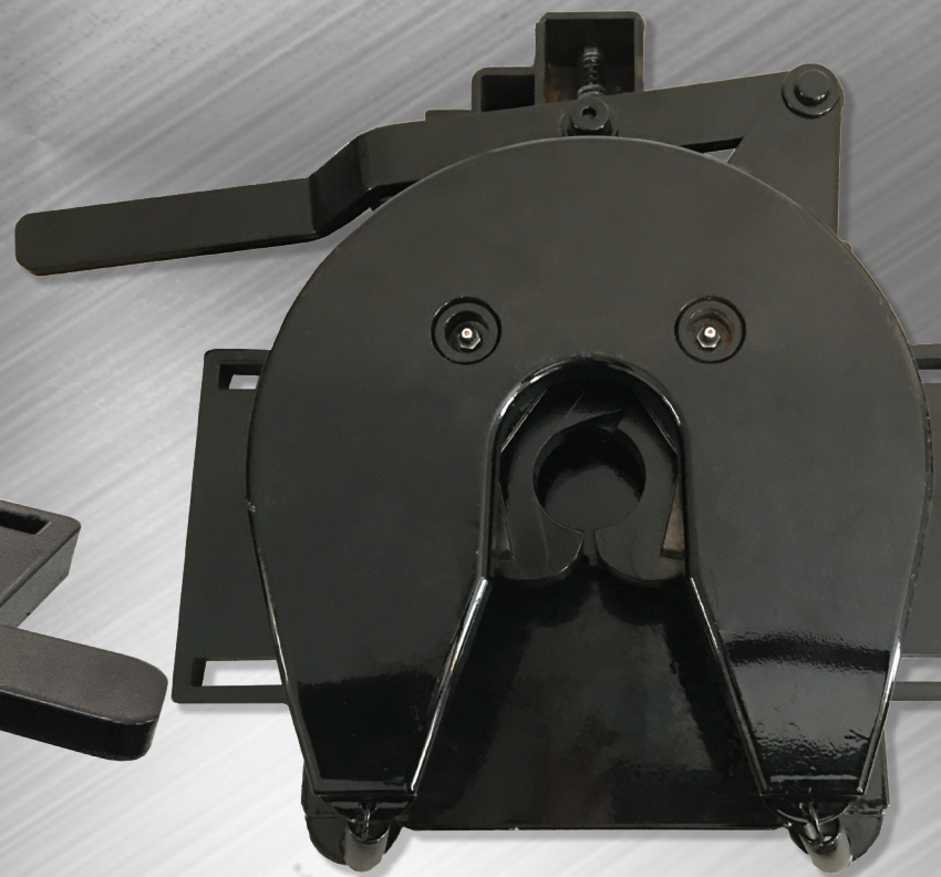
4 Grease Point Locations